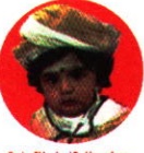
Poojya Chikanjevi Daddappa Appa * Bahadur Prathipathi Sharnbasveshwar Sanstha, Kalaburagi